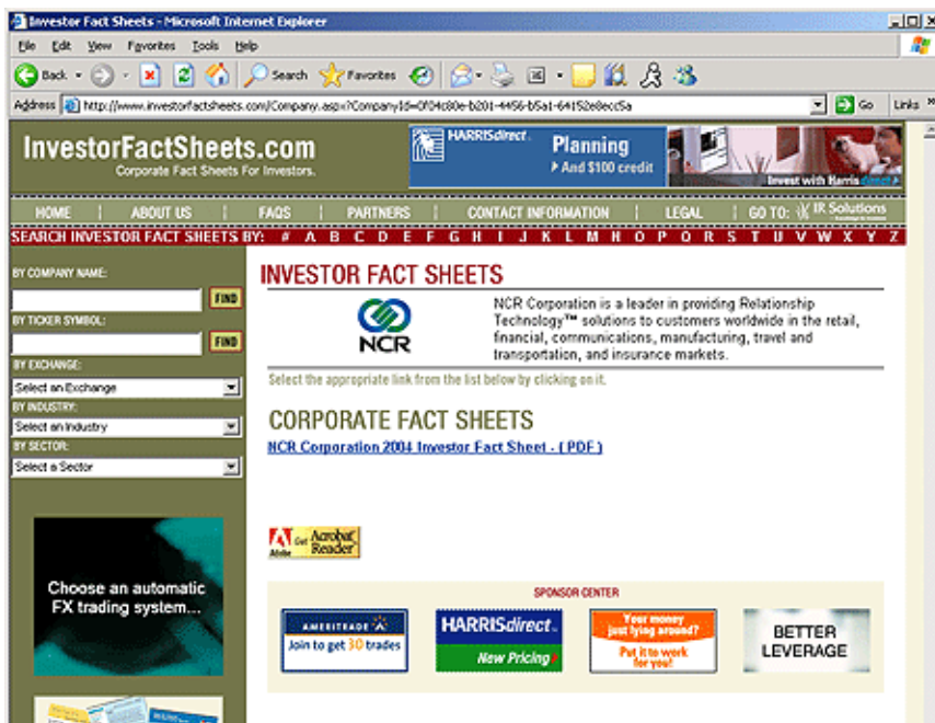
- InvestorFactSheets.com Company Page

InvestorFactSheets.com's service is the industry standard for corporate fact sheet related information. Individual and Institutional investors rely on InvestorFactSheets.com as their single comprehensive source for corporate fact sheets. Our individual investor service is provided free through InvestorFactSheets.com. Our institutional investor service is provided on a monthly subscription basis to thousands of analysts and portfolio managers as well as on a firm-wide data-feed basis.